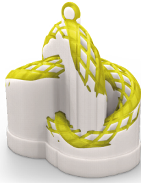
Visijet Crystal in support material