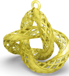
Visijet Crystal metal casting pattern, no support material