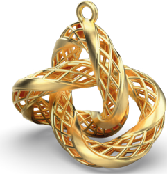
Final gold casted jewelry piece