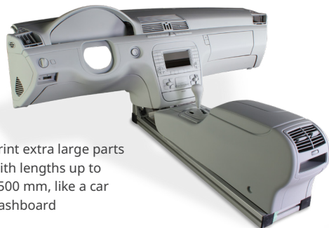
Print extra large parts with lengths up to 1500 mm, like a car dashboard

The ProJet 7000 offers the same SLA benefits of the ProJet 6000, with more than double the build volume so you can print even larger parts for prototyping, rapid tooling and end use with fine-feature detail.