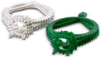
Figure 4 JCAST-GRN 10 is a green material, ideal for small, fine-featured jewelry master patterns for gypsum investment casting applications. This material leaves minimal ash after burnout to produce superior casting quality. Create and produce custom jewelry or other investment castings that capture fine detail with a smooth surface finish.