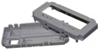
Electronic housing prototype printed in Accura Xtreme™