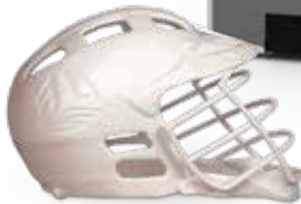
Helmet model printed in Accura Xtreme™ White 200