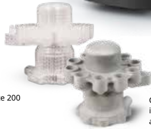
QuickCast® pattern in Accura ClearVue, and aluminum casting