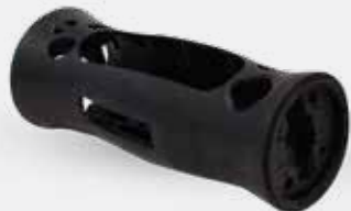
Toy prototype printed in Accura ABS Black

SLA printers are able to print highly detailed, tiny parts just a few mm in size, all the way up to 1.5 m long parts—all at the same exceptional resolution and accuracy. Even large parts remain highly accurate from end-to-end, with virtually no part shrinkage or warping.